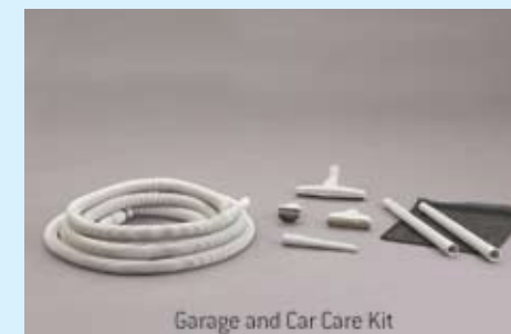
Garage and Car Care Kit