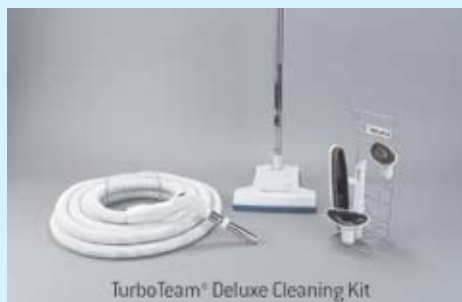
TurboTeam™ Deluxe Cleaning Kit