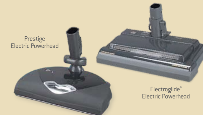
Prestige Electric Powerhead

Electric powerheads like the Prestige and Electroglide® provide reliable cleaning performance. Quick connections for wands and electrical cords, manual carpet height adjustment and easy maneuverability provide versatility and convenience. Electric powerheads carry a one-year manufacturer's warranty.