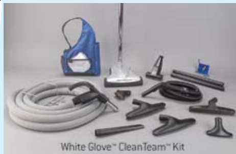
White Glove™ CleanTeam™ Kit