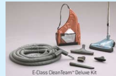
E-Class CleanTeam™ Deluxe Kit